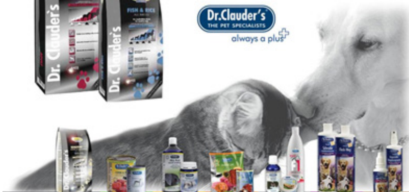
Best Choice Selected Meat Function & Care Functional Snacks Beauty & Care Hygiene Anti Flea